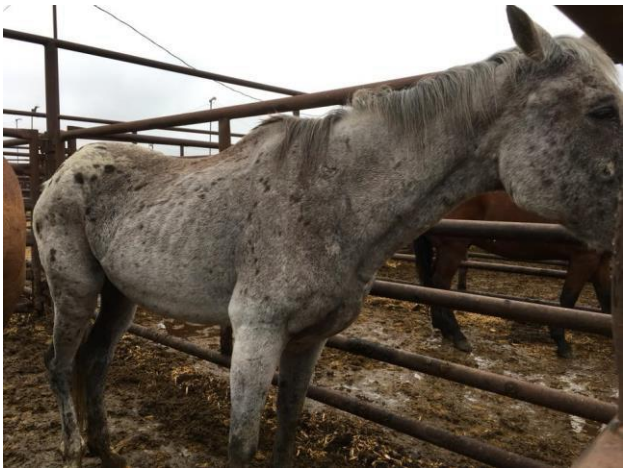
Emaciated half-blind mare at Tofield, AB auction - Sept. 2018

No horse is safe from the slaughter pipeline. Some people will send unfit and sick horses to an auction rather than taking care of the horse themselves.