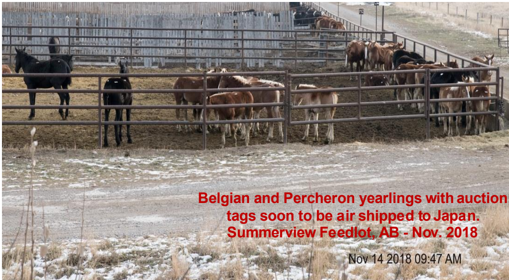
Belgian and Percheron yearlings with auction tags soon to be air shipped to Japan. Summerview Feedlot, AB - Nov. 2018